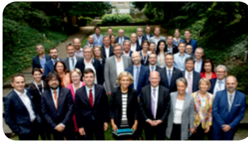
Delegates and Political Representatives at the EMTA 20 th Anniversary Assembly in Paris